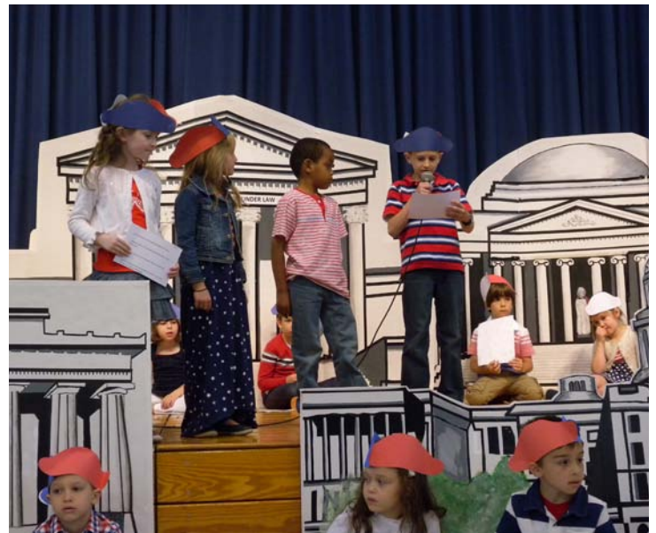
First grade students at Goldwood Primary School performed a collection of poems, songs and recitations about Washington, D.C. for their families and friends.

On May 22, first graders at Goldwood Primary School took a trip to Washington D.C. and brought the audience full of parents, grandparents, and friends along with them.