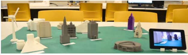
Rocky River High School art students designed and printed Cleveland landmarks, including the Terminal Tower, FirstEnergy Stadium and the Great Lakes Science Center.